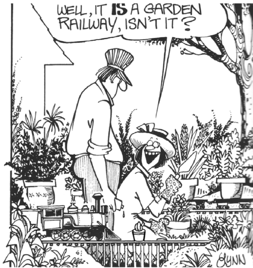
Found in Telegram