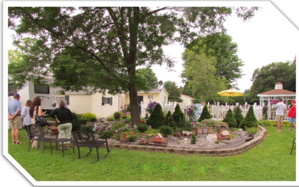
Carl Cramer's Open House