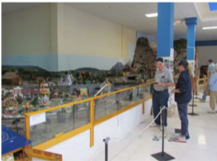
Driver's Village Layout Open House