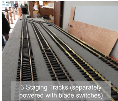
3 Staging Tracks (separately powered with blade switches)